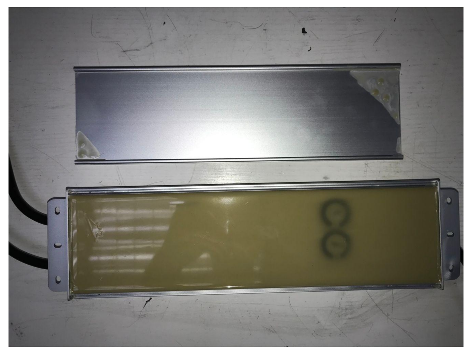
---- End of Test Report----